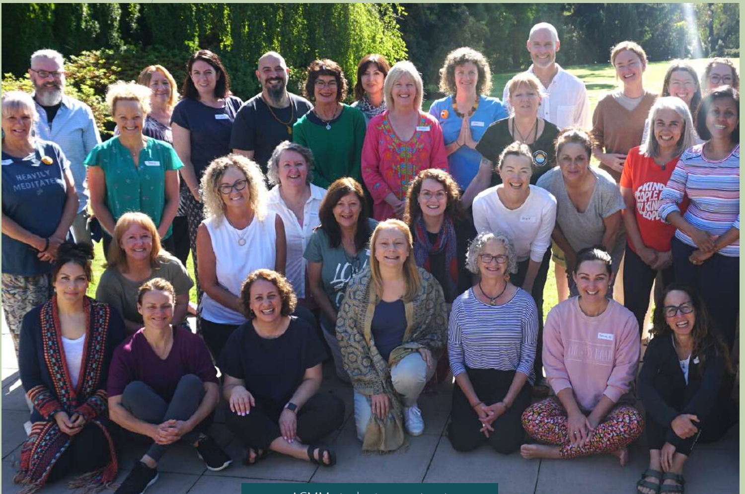
ACMM students on retreat

Step onto a deeply fulfilling path as a Meditation and Mindfulness Teacher