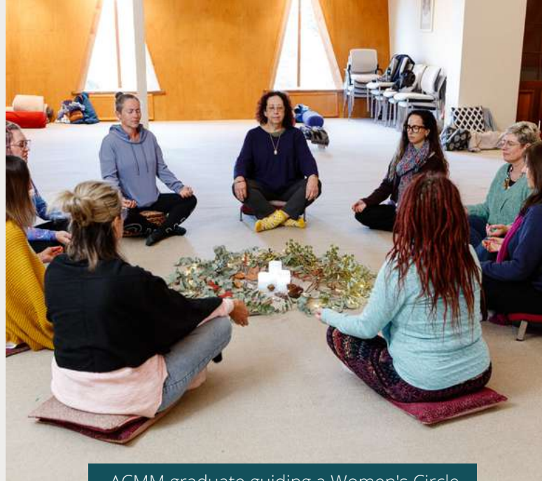
ACMM graduate guiding a Women's Circle

Emotions and everyday problems can weigh on our mind and prevent us from meditating effectively. This program gives you the opportunity to try effective journaling techniques to help unload stressors and move into a more positive frame of mind.