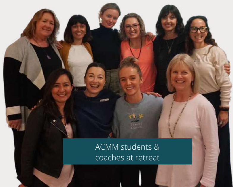
ACMM students & coaches at retreat

Retreats are an optional extra for the Cert/Adv Cert and required for the Diploma. Complete a retreat at any time to obtain credits towards the Diploma. Many students and grads keep coming back to our retreats for the deeply healing and connective experience. Available online or in person.