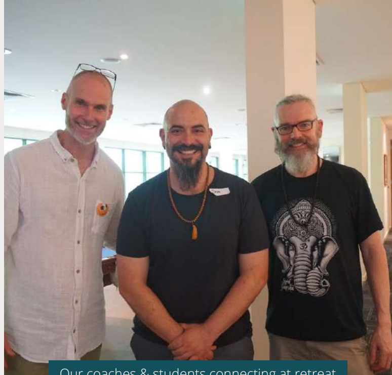
Our coaches & students connecting at retreat

The Business Lounge is open to all students and graduates for a tiny yearly fee. It also offers business resources, discounts on events and retreats, business mentoring and so much more!