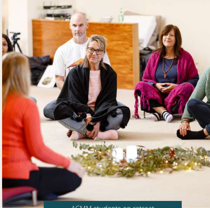
ACMM students on retreat