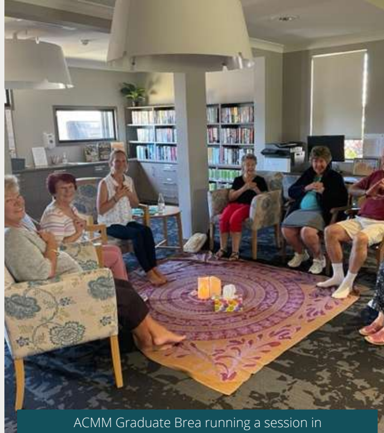
ACMM Graduate Brea running a session in a lifestyle village

When you enrol in this program you will be placed in a local support service organisation to deliver 6 x 45-minute meditation and mindfulness sessions to residents, patients or clients of the organisation.